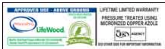
LifeWood end tag example

It’s easy to identify warranted LifeWood brand wood products. Simply look for the plastic end tag or ink stamp on each piece of LifeWood brand wood. Make sure you receive and retain all LifeWood end tags, as well as the original purchase receipt(s) from your lumber dealer or contractor/builder. In the event of a claim, it will be necessary to present this documentation for all materials claimed.